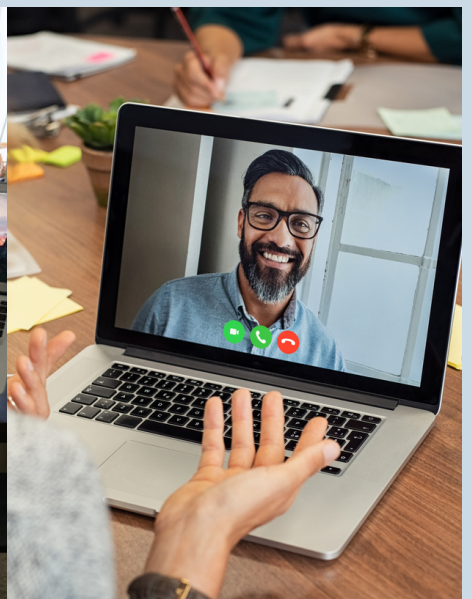
Practice with family and friends