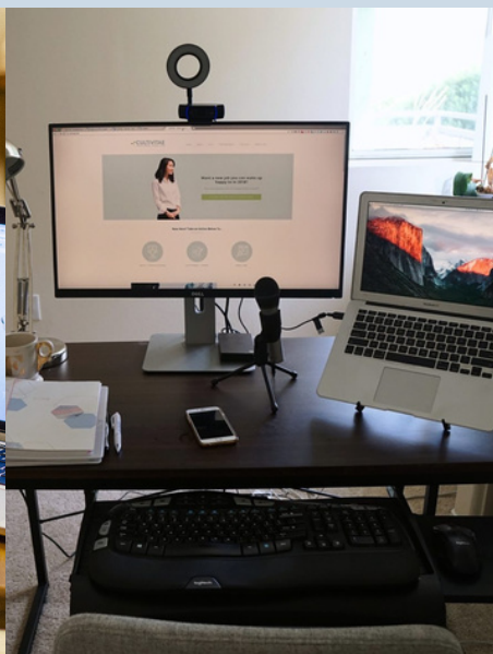
Test out your setup and equipment